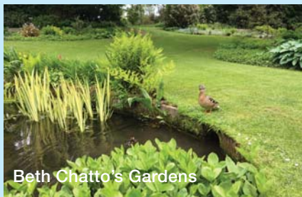
Beth Chatto's Gardens